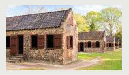
Boone Plantation Charleston