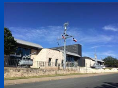
Admiral Nimitz Pacific War Museum