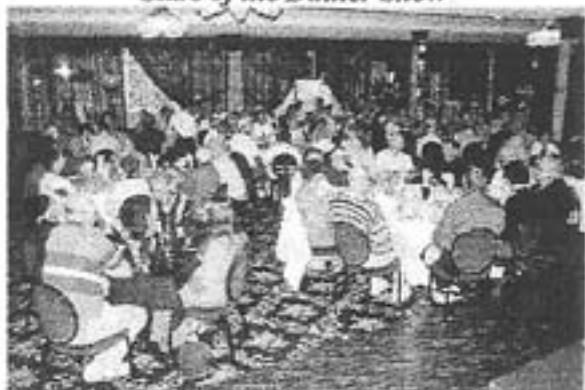
At the Dinner Show