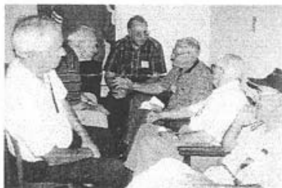
Serious discussions in the hospitality Suite