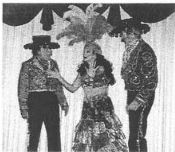
Stars of the Dinner Show