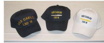
Baseball Caps - all styles $9.00

Dues notices will be going out before Thanksgiving. Dues are payable by January 1, 2021. Per our by-laws you will be removed from active member status if your dues are not received by March 1, 2020. Your membership code will be changed from "M", active member, to "F", former member. Your prompt payment is appreciated.