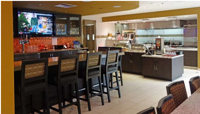
Bar and Kitchen Buffet