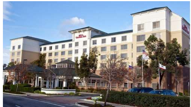
Hilton Garden Inn San Mateo